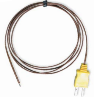
Thermometer Probe Wire