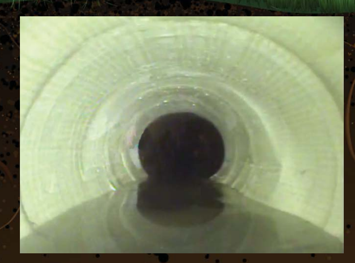
AFTER HAMMERHEAD POINT REPAIR