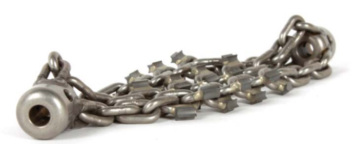
922-8118, 6.00" Original Chain 1/3" Shaft