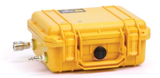
PR-REGULATOR, Air Regulator