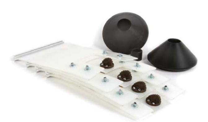
922-8153, Pipe Cutter 6.00" Panel Package, 4 panels, w/Centralizers