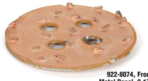
922-8074, Front Metal Panel, 2.17"