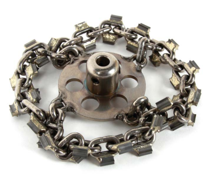
922-8125, 6.00" Cyclone Circular Chain 1/3" Shaft