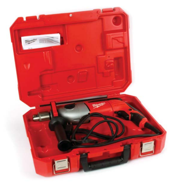
922-5431, High RPM Hand Drill