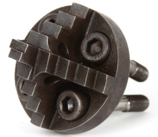
922-8079, Front Drill Head, Ridged, 1.38"